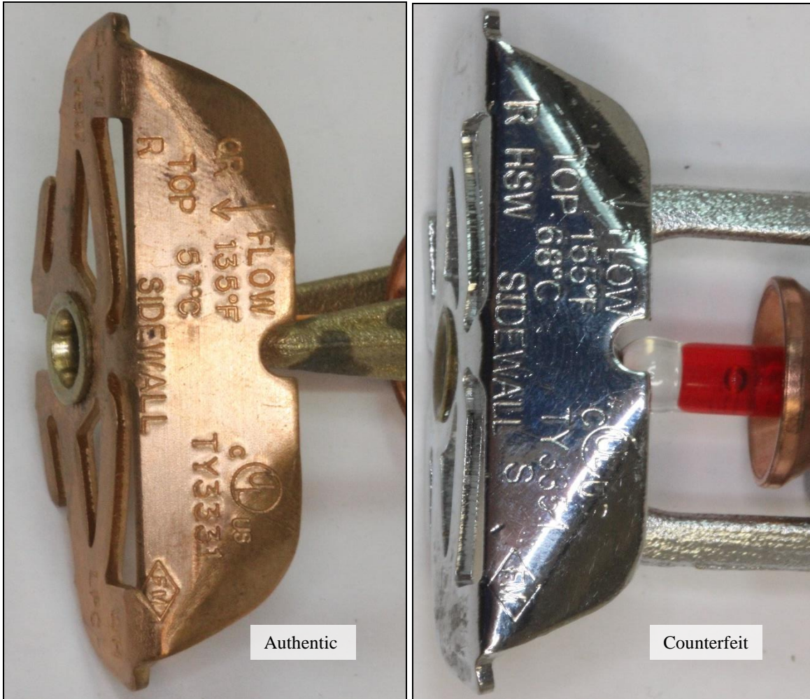
Figure 4. Authentic TY3351 deflector (left) and counterfeit deflector (right). The markings are similar, including the appearance and position FM Approvals mark.

Figure 4 below shows the deflectors of the authentic and counterfeit sprinklers. The content and positioning of the stampings on the deflectors are largely the same. The most noticeable difference, as mentioned previously, is the orientation of the deflectors. Authentic deflectors are oriented with their long dimension perpendicular to the frame arms as shown at left, while the counterfeit deflectors are attached 90 degrees to that orientation.