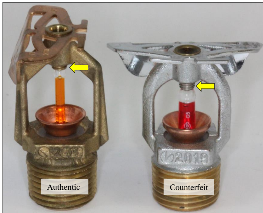
Figure 1. Photograph of a counterfeit TY3351 sprinkler (right) and an authentic Tyco TY3331 pendent sprinkler (left).

Figure 1 is a photograph of an authentic TY3331 sprinkler next to one of the counterfeit TY3351 sprinklers. Tyco also makes TY3351 sidewall sprinklers, and the only difference is the use of a 5 mm bulb instead of a 3 mm, but there was not one available for the photographs below. Chrome-plate TY3351 sprinklers are also FM Approved even though this example has no decorative finish. The markings on the wrench boss are similar between the two and include the name “TYCO” (on the opposite side to the one shown), the year of manufacture, and a mold cavity identification symbol. The shape of the frame arms of the counterfeit sprinkler are clearly different, and the deflector is attached parallel to the frame arms, while it is always perpendicular to the frame arms in authentic versions. The counterfeit also uses a visibly different compression screw, indicated by the arrows in the left photo, which is silver in color (even in chrome plated authentic sprinklers, the compression screw is plain brass) and has several more exposed threads.