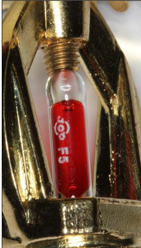
Figure 3 – Detail of the counterfeit frangible bulb

Figure 3 below shows the counterfeit bulb in more detail. The ink marking on the bulb “Job F5” bears strong resemblance to authentic Job bulbs, however this bulb was not produced or marked by JOB GmbH. Also of note, there are not any currently FM Approved sprinklers that utilize authentic Job model F5 frangible bulbs.