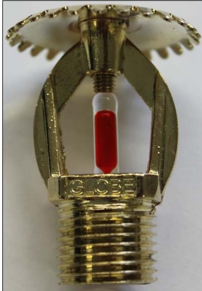
Figure 2 – Profile of the counterfeit sprinkler

Figure 2 below shows a profile view of the counterfeit sprinkler, bearing the “GLOBE” casting mark on the wrench boss.