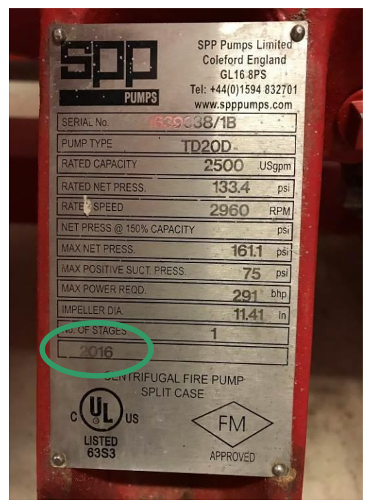
Figure 2 – Nameplate

Nameplates dated June 2014 through January 2018 are affected by this Product Alert.