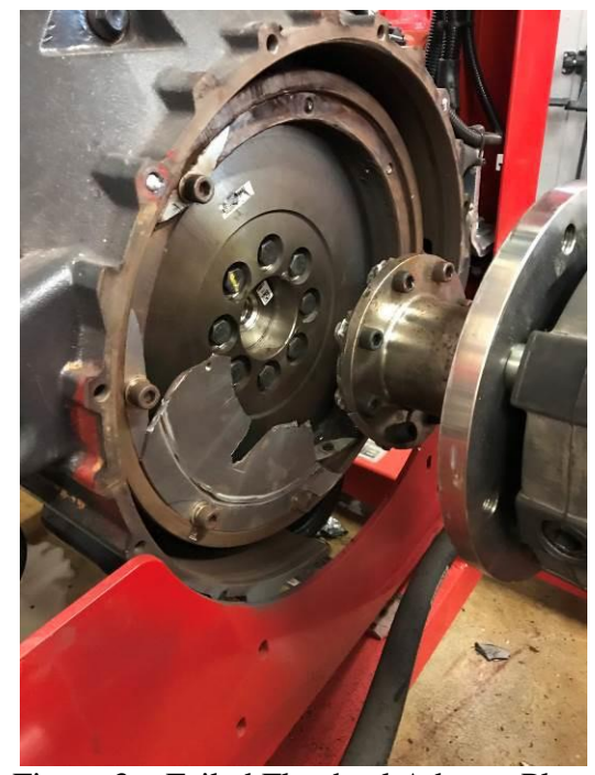
Figure 3 – Failed Flywheel Adapter Plate

Nameplates dated June 2014 through January 2018 are affected by this Product Alert.