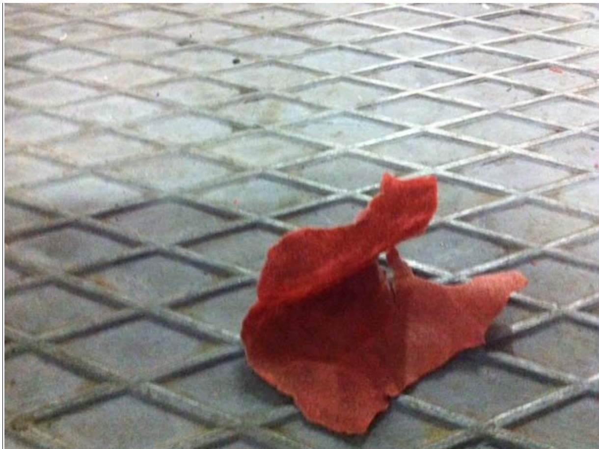
Figure 2 shows a fragment of delaminated coating from a Model RAF-80 water pressure relief valve.