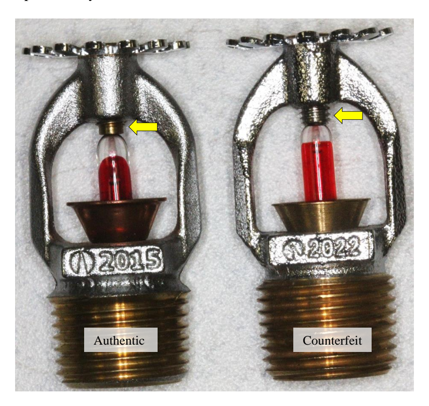
Figure 1. Photograph of an authentic Tyco TY325 sprinkler (left) and a counterfeit TY325 sprinkler (right). The arrows highlight the different appearing compression screws.

Figure 1 is a photograph of an authentic TY325 sprinkler next to one of the counterfeit TY325 sprinklers. The markings on the wrench boss are similar and include the name "TYCO" (on the opposite side to the one shown), the year of manufacture, and a mold cavity identification symbol. The counterfeit uses a visibly different compression screw (indicated by the arrows in the photo) which is silver in color and has several more exposed threads. The orifice caps are also visibly different. The authentic TY325 uses a cold formed copper cap while the counterfeit has a machined cap that is a yellow/brass color.