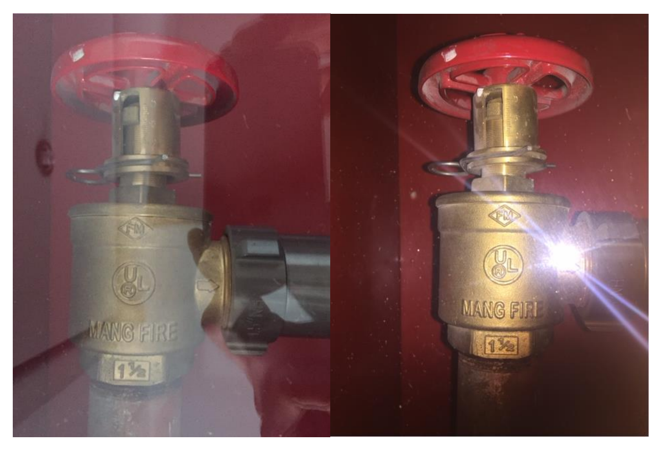
Figure 1 – Suspected Counterfeit Pressure Reducing Valves