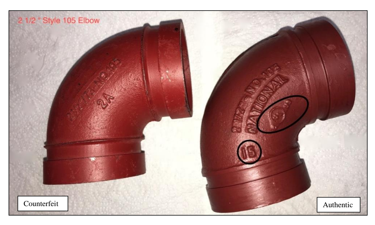
Figure 2. Comparison of a counterfeit 2 ½" elbow (left) and an authentic National Fittings style 105 2 ½" grooved elbow (right).

Figure 2 shows the reverse side of the same grooved elbows (counterfeit on the left and authentic on the right) shown in Figure 1. While the counterfeit elbow bears the same size and model marking as the authentic, it does not show the manufacturer mark on this side like the authentic elbow.