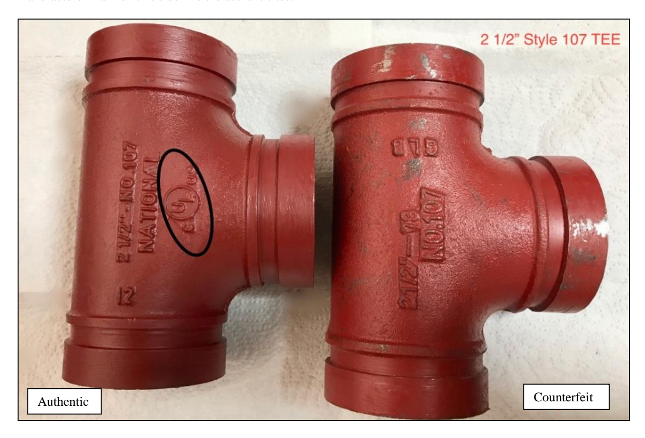
Figure 4. Comparison of an authentic National Fittings 2 ½" grooved tee (left) to one of the counterfeit 2 ½" grooved tee (right) bearing a counterfeit FM Approvals marking

Figure 4 shows the reverse side of the same grooved tees (counterfeit on the right and authentic on the left) shown in Figure 3. While the counterfeit tee bears the same size and model marking as the authentic, it does not show the manufacturer mark on this side like the authentic tee.