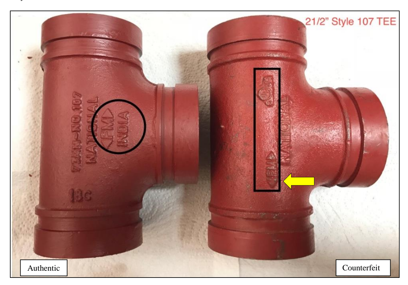
Figure 3. Comparison of an authentic National Fittings 2 ½" grooved tee (left) to one of the counterfeit 2 ½" grooved tee (right) bearing a counterfeit FM Approvals marking (highlighted with arrow)

Figure 3 shows a counterfeit grooved tee, 2 ½" NPS (at right) that resembles the authentic Style 107 grooved tee manufactured by National Fittings (at left). While the counterfeit shows the "NATIONAL" manufacturer mark, only the authentic elbow bears the location of manufacture "INDIA."