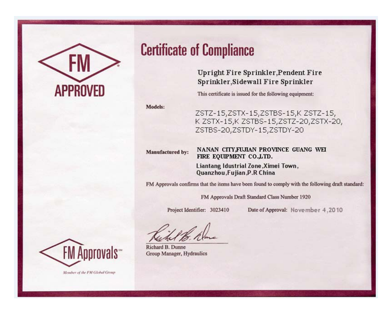
Fig. 1 – Counterfeit Certificate

This document is a falsification of an actual FM Approvals' Certificate of Compliance. This document has been altered and misrepresents the models indicated as FM Approved. FM Approvals has issued no such FM Approval for these products. Any claims otherwise are false.