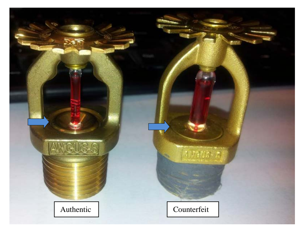
Figure 1 – Profile view of an authentic Angus Model S sprinkler (left) and the sprinkler identified as counterfeit (right)

Figure 1 below shows an authentic Angus Model S K5.6 standard spray pendent type sprinkler on the left and the counterfeit sprinkler on the right. The shape of the counterfeit sprinkler frame, particularly the frame arms, is different from the authentic version. Additionally, the counterfeit sprinkler uses a bulb seat (indicated by the blue arrow) with a flat profile across the top while the bulb seat on the authentic Model S has a slight depression towards the center where the end of the framgible bulb is supported.