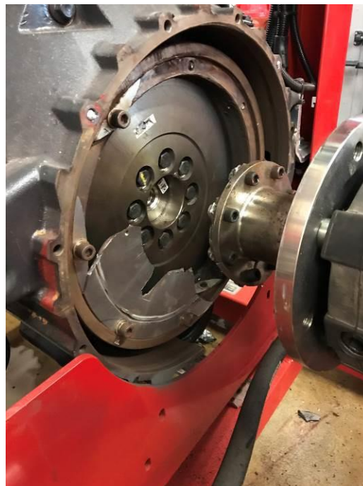
Figure 3 – Failed Flywheel Adapter Plate

Nameplates dated June 2014 through January 2018 are affected by this Product Alert.