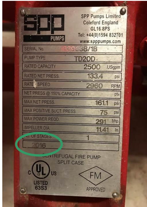
Figure 2 – Nameplate

Nameplates dated June 2014 through January 2018 are affected by this Product Alert.