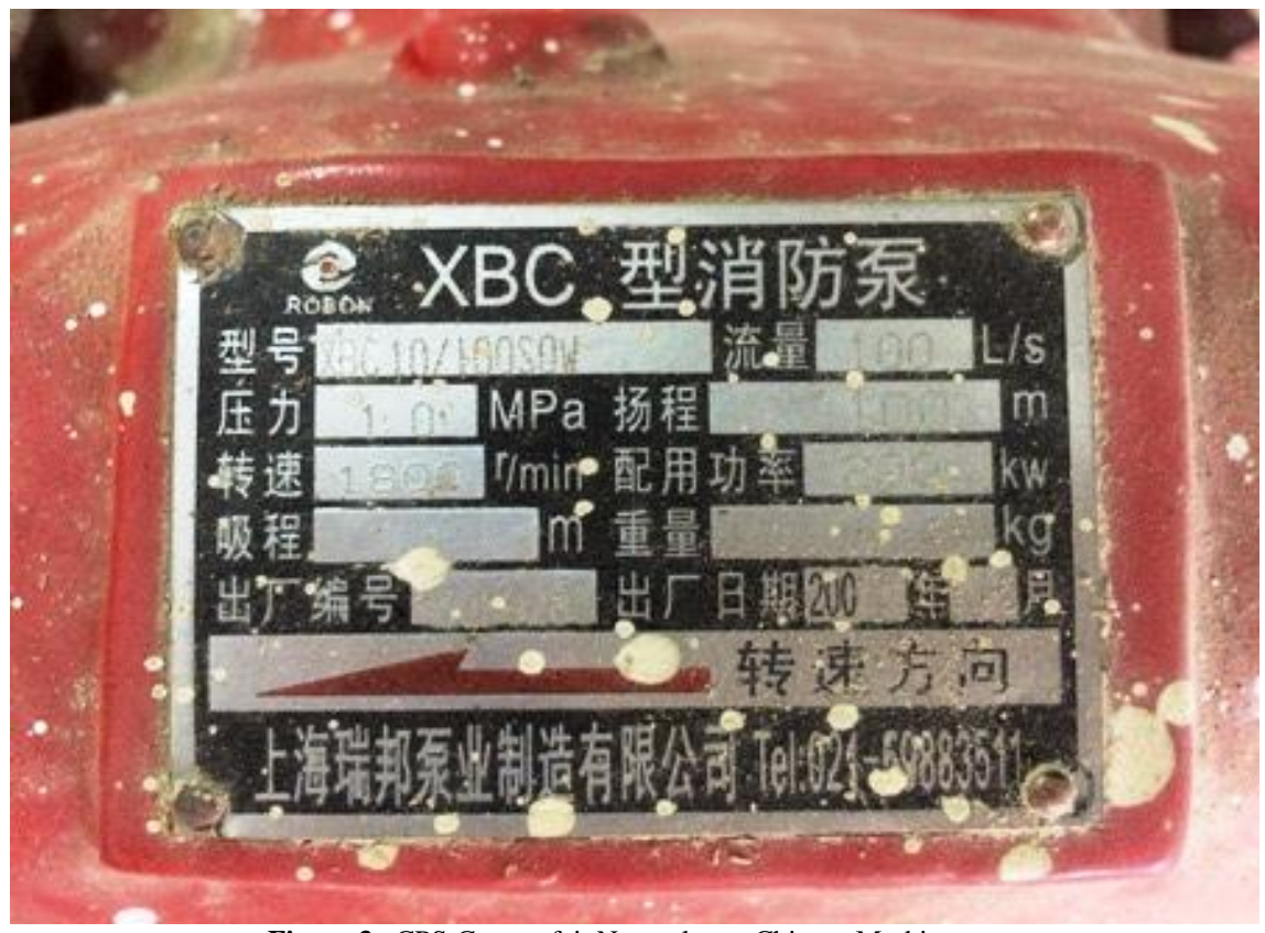
Figure 3. CPS Counterfeit Nameplate – Chinese Markings