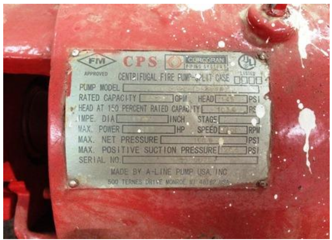
Figure 2. CPS Counterfeit Nameplate