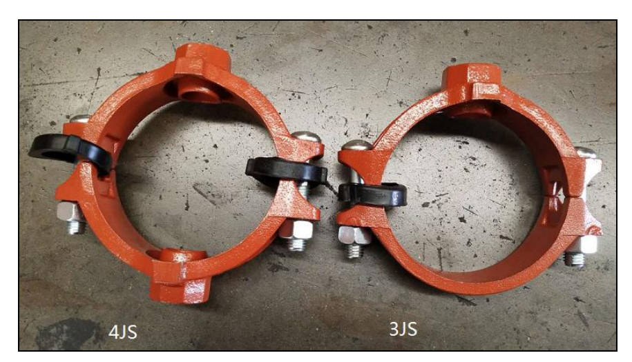
Figure 1. An example of the non-FM Approved Model 4JS mechanical cross on the left, and an FM Approved Model 3JS mechanical tee on the right

Figure 1 shows a side by side comparison of a Model 4JS mechanical cross on the left, incorrectly marked as FM Approved, and a Model 3JS mechanical tee for the same size pipe run, correctly marked as FM Approved. The Model 4JS mechanical cross is made up of two parts very similar to the upper part of the Model 3JS. The incorrect Model 4JS crosses were mistakenly assembled with two parts from the Model 3JS.